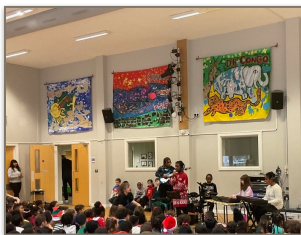
Below: Y5 performing at the Rock Steady concert.

We will also be learning about online safety in ICT, making safer choices in PSHE, and French.