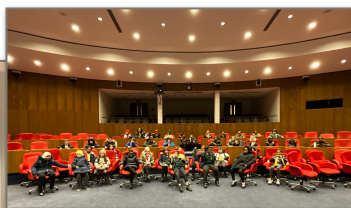
Above: Y5 at the Council Chambers